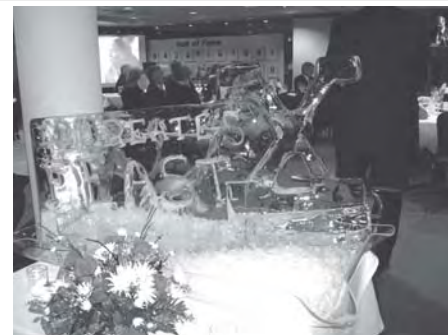
Laureate Feast X Ice Sculpture